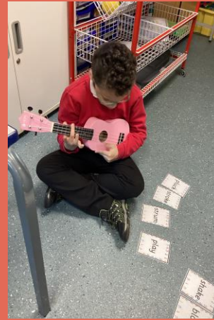
Well done Hawks for a fantastic Autumn term! Here are some of our best bits...