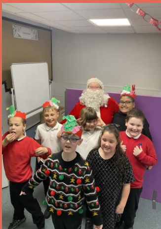
We wish you all a Merry Christmas and Happy New Year!