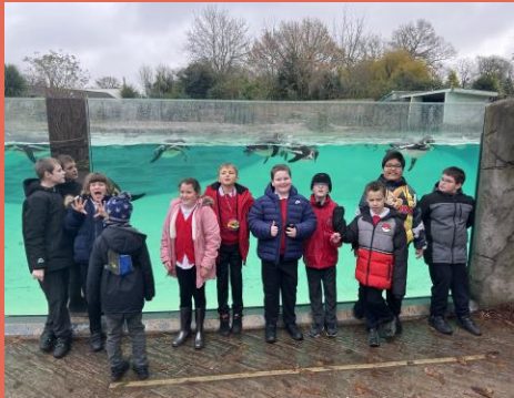
Going to Chester Zoo and Blue Planet Aquarium.