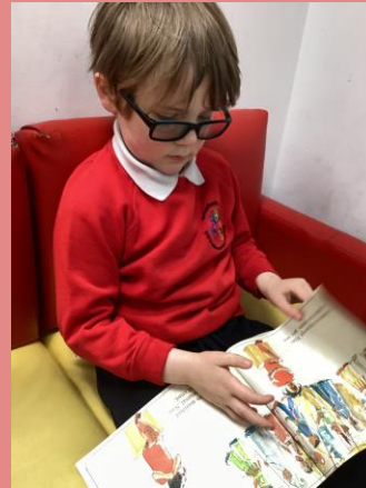
The world around us