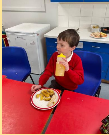
Eating with our friends