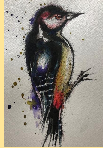
What makes us happy...