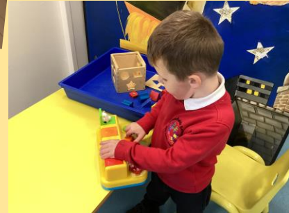
My thinking & problem solving