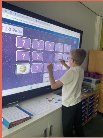
Life Skills- learning all about Earth and Space.