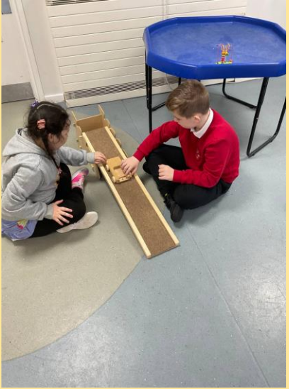
Exploring forces in Science