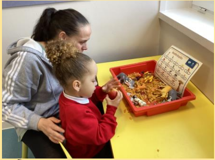
Exploring seasonal changes