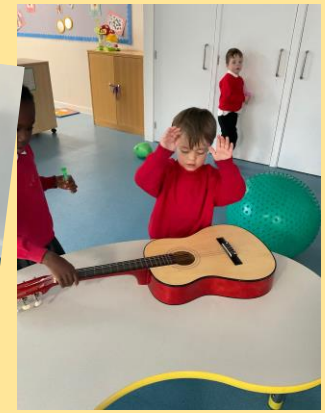
Exploring musical instruments