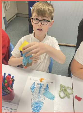
Creative Development - designing and making our own fireworks!