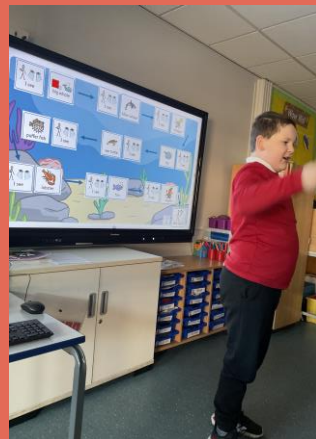
Communication and Language- sequencing and retelling the story 'I see the Sea'.