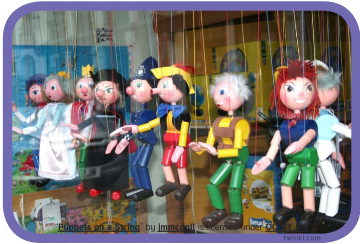
"Puppets on a String" by immcdoll is licensed under CC BY-NC-ND 4.0