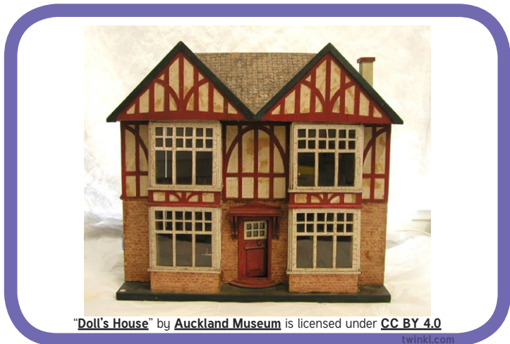
"Doll's House"