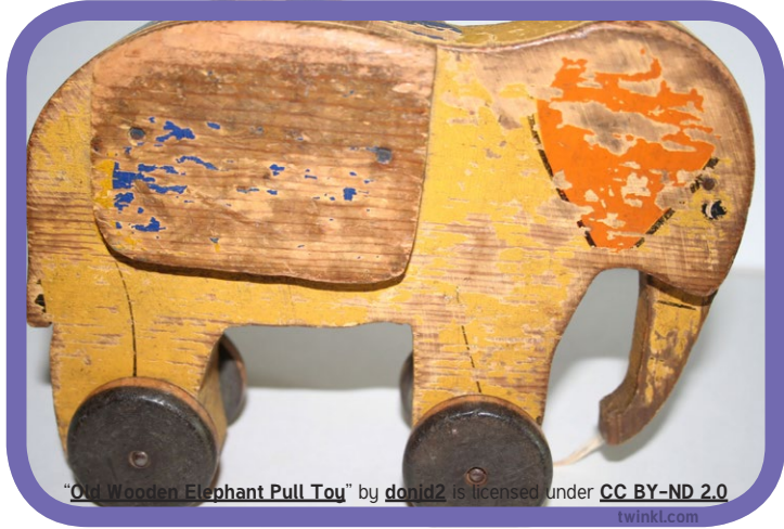
"Old Wooden Elephant Pull Toy"